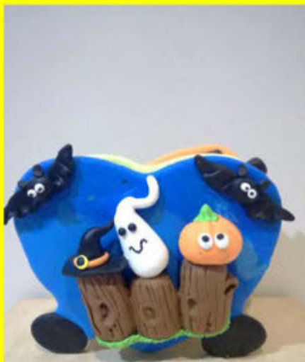
Oct 20 & 27, Halloween box

A creative and fun hands on activity for kids. All products are made by air-dried clay, kids can bring them home directly and keep them forever!