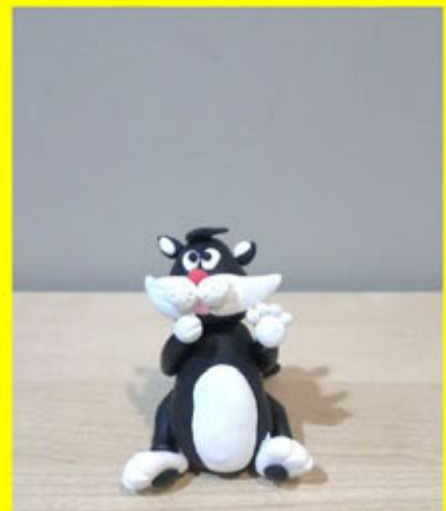
Nov 3, cat