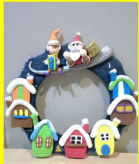
Nov 24 & Dec 1, 8, Christmas wreath