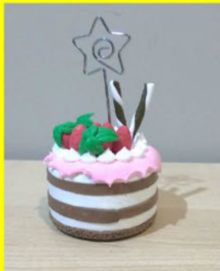
Nov 17, birthday cake