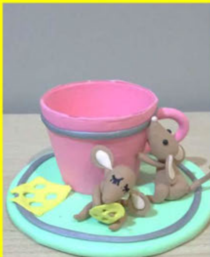
Nov 10, tea time