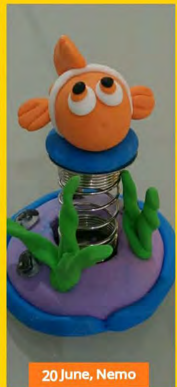
20 June, Nemo