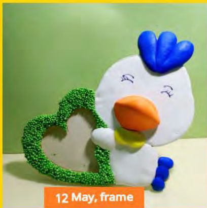
12 May, frame

A creative and fun hands on activity for kids. All products are made by air-dried clay, kids can bring them home directly and keep them forever!