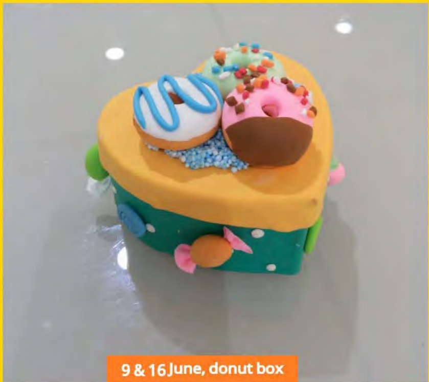
9 & 16 June, donut box