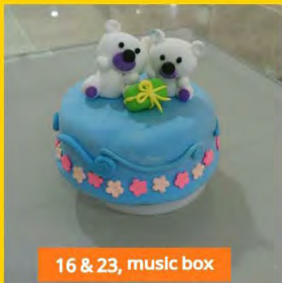
16 & 23, music box