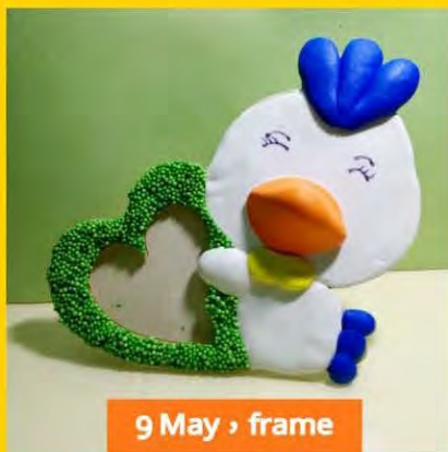
9 May , frame

A creative and fun hands on activity for kids. All products are made by air-dried clay, kids can bring them home directly and keep them forever!