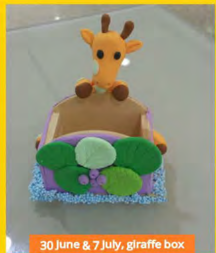
30 June & 7 July, giraffe box