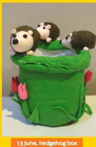
13 June, hedgehog box