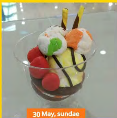
30 May, sundae