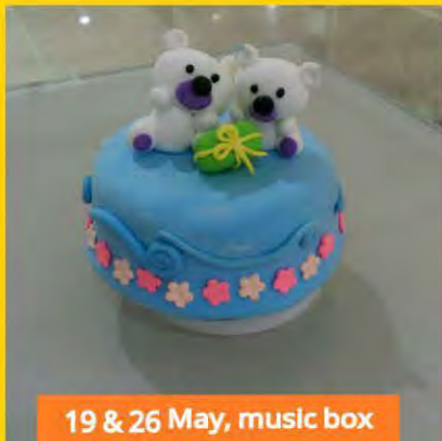
19 & 26 May, music box