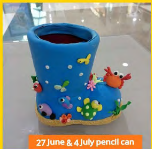
27 June & 4 July pencil can