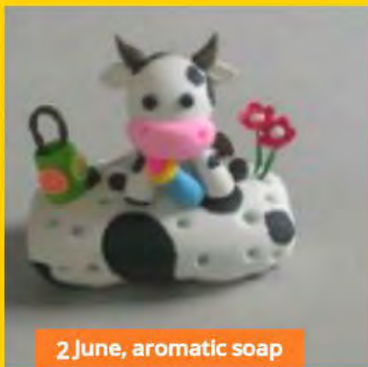
2 June, aromatic soap