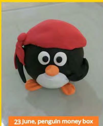
23 June, penguin money box